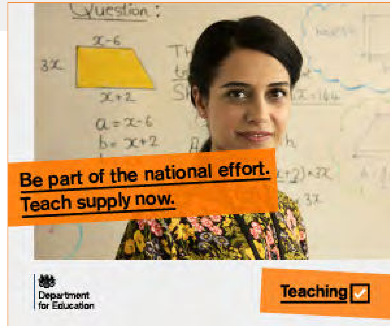
MPU 300x250 px