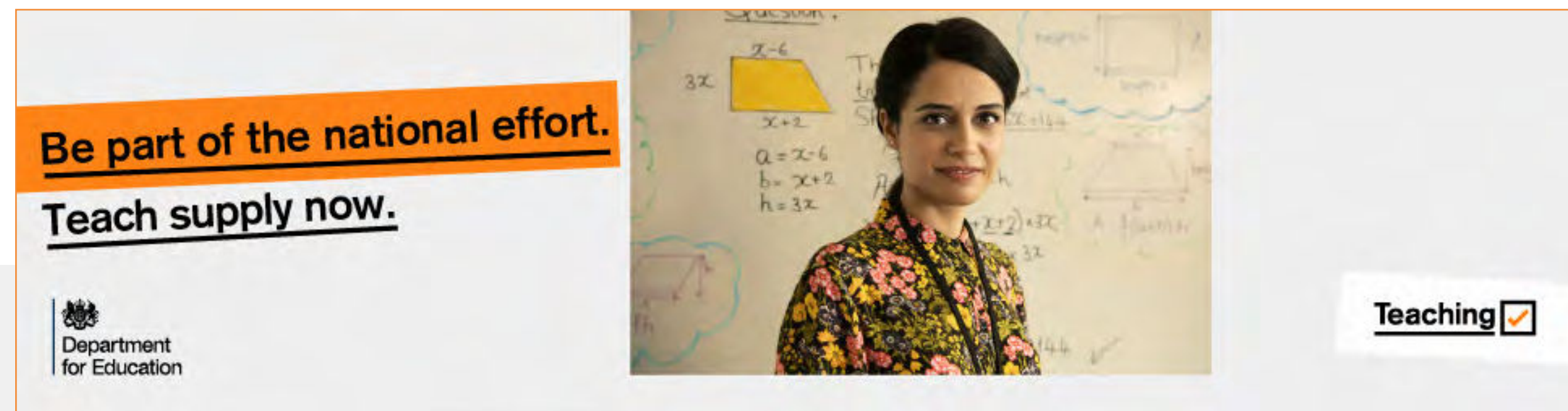
Billboard 970x250 px