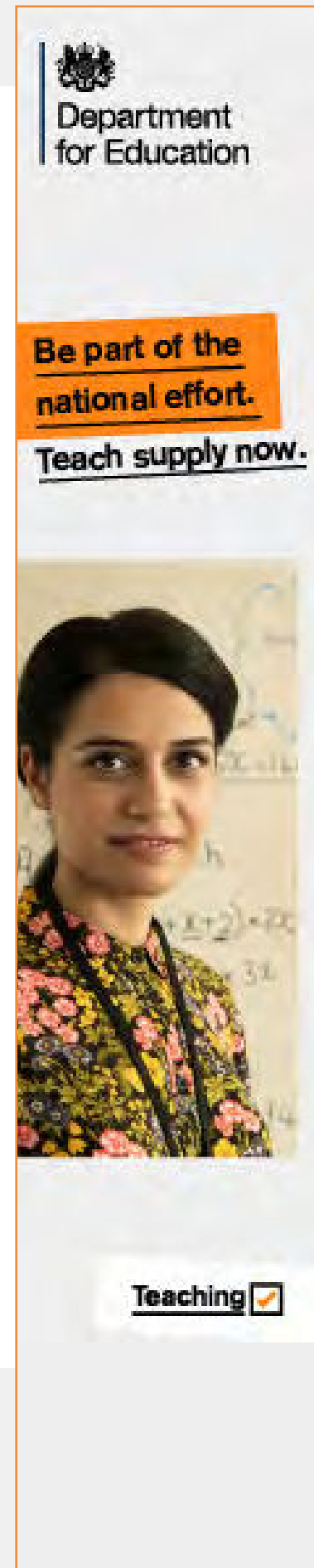
Skyscraper 120x600 px